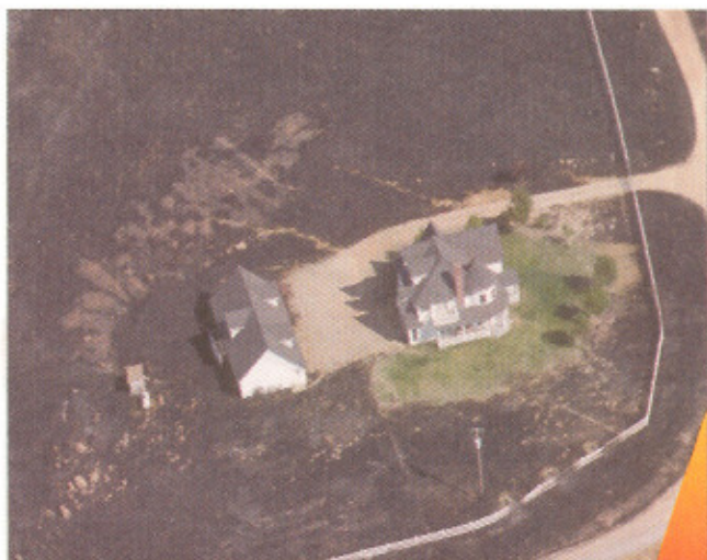
A home with 100 feet of defensible space can be the difference between one that burns and one that survives.

FACT: It does matter. Making a clean, open space 100 feet around your home can help firefighters save it and your family and pets. The photo below is a perfect example of how defensible space saved this person's property.